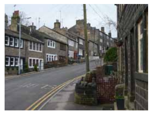
Top: Bronte Parsonage Museum, Haworth Middle: Oxenhope Railway Station Bottom: Oakworth